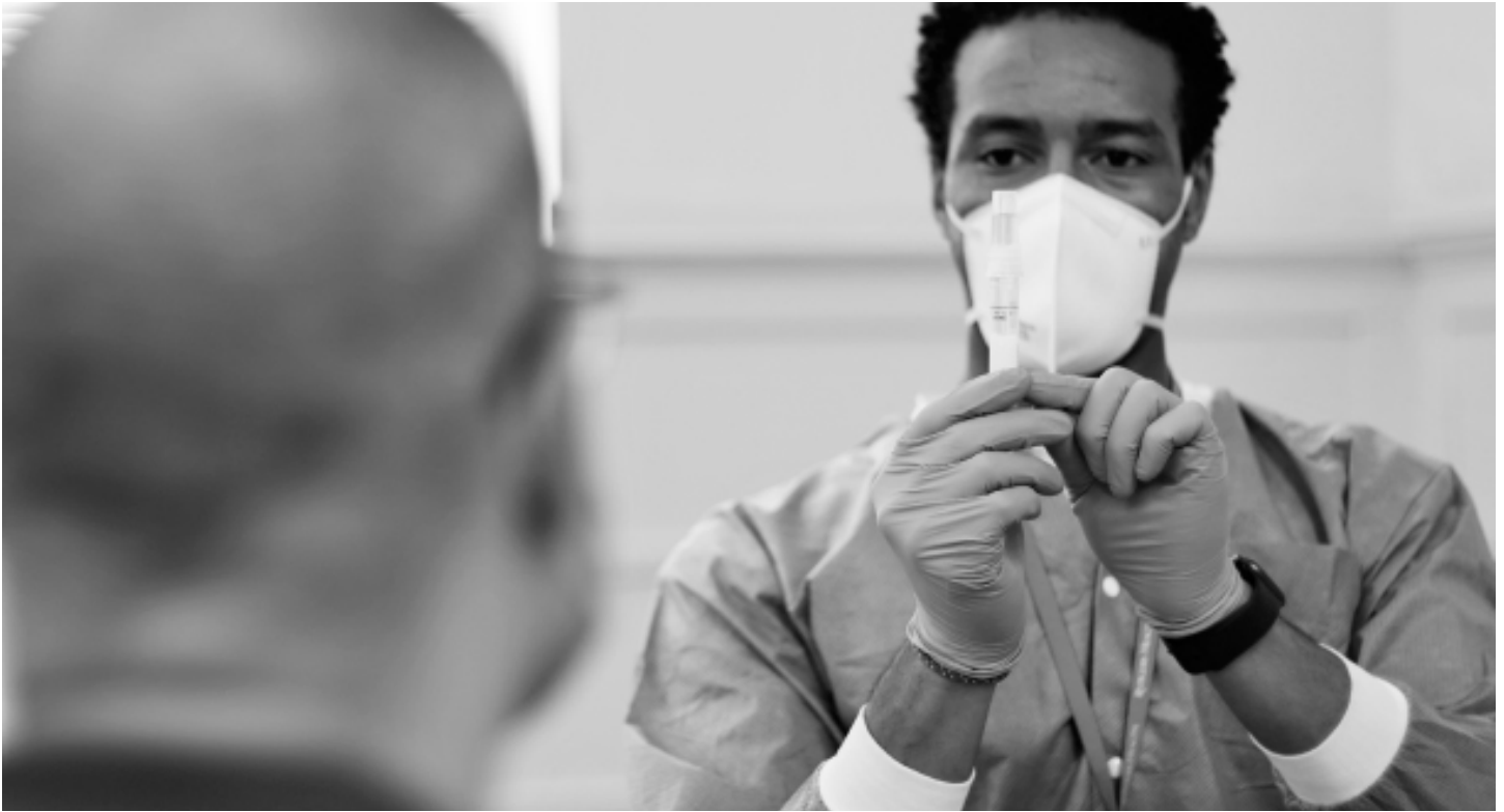
A healthcare worker takes part in the mass testing of employees at the New Jersey Department of Corrections Central Office headquarters.